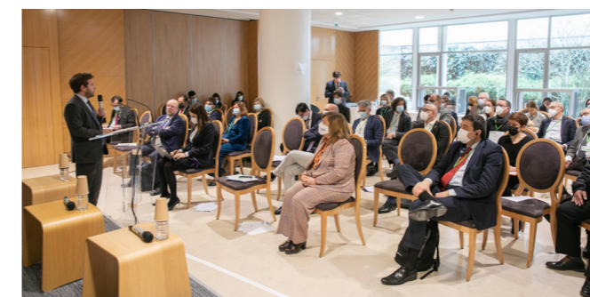
SGI Europe CSR Label Awarding Ceremony, hosted by EDF

The project's main objective was to improve training systems and ensure inclusive, quality and effective skills provision and long-term skills strategies to foster innovation and encourage innovation outcomes through the engagement of social partners, especially in the industry 4.0 revolution (and its new technologies and challenges).