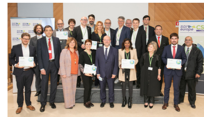
SGI Europe CSR Label Awarding Ceremony, hosted by EDF

SGI Europe also carries out projects promoting the importance of modern services and SGIs in Europe . Whether supported by the European Commission or carried out independently, SGI Europe brings a new light on services of general interest, their modernisation and their central role in citizens' lives.