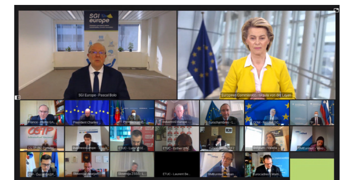
SGI Europe at the Tripartite Social Summit, with Ursula von der Leyen, President of the European Commission

Balancing risks and opportunities, SGI Europe put forward a middle way, proposing to EU institutions to take a supportive approach to Member States and national social partners in their diverse efforts to provide a clearer framework for the platform economy .